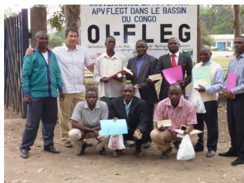
Signature of the first contracts with leader CSOs of Bouenza, Kouilou, Lékoumou, Niari and Plateau

Momentum to build the CSO network development will continue during the next semester starting with a meeting in October to share lessons learned, conduct further trainings, and identify next steps. If the vision is realised, it will be the first time IM-FLEG is led by national civil society.