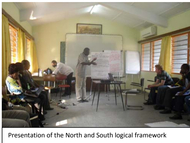
Presentation of the North and South logical framework

The greatest weaknesses identified were in the realm of achievability. All 4 frameworks presented approaches that, when considering the political, logistical realities and capacity limitations of civil society, appear overly ambitious. For instance, the Equator group aimed to achieve sustainable natural resource management within 50 local communities within 5 years. Unless the 50 communities are rather small and have already made considerable progress to achieve this goal, the likelihood of success is questionable. The Kinshasa group aims to put in place an IM-FLEG programme despite the fact they have no prior experience with IM and do not include any activities in their framework to build this capacity.